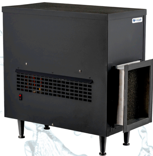
CR-UCM1 shown with optional CR-ABUCM air baffle